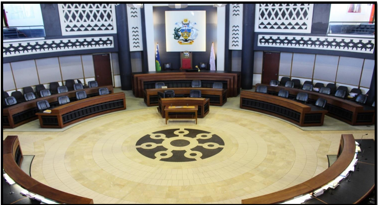
National Parliament of Solomon Islands.