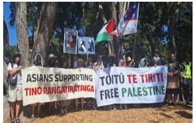
#SupportingPalestine has meant supporting all indigenous across all regions.