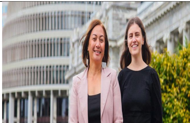
Co-Leaders Hon Marama Davidson & Hon Chlöe Swarbrick

■ Last year we ran our largest General Election campaign to date (election day was in October, 2023) and we had some great success, including: achieving our highest party vote share and greatest number of MPs yet; as well as elected the most Māori and Pasifika MPs in our Party's history. We returned an MP for the Auckland Central electorate and gained MPs in the Wellington electorate and Rongotai electorates. This is the first time we have held an electorate seat, and the first time we have won more than one electorate seat. These MPs are providing effective opposition to the government supported by outreach to engage with communities across the country.