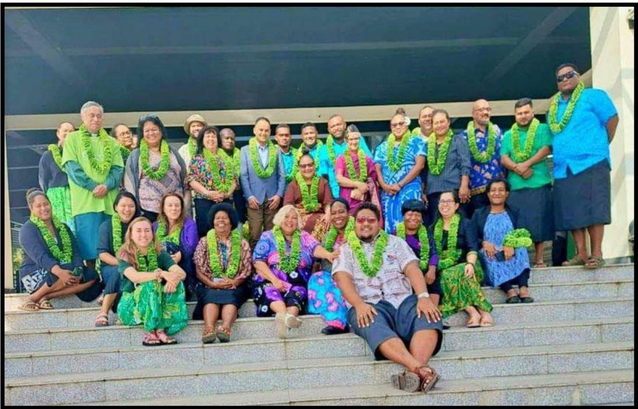
Pacific Youths committing to the Youth Agenda and APYGN; NIU Pacific Greens Fono (Fiji24).