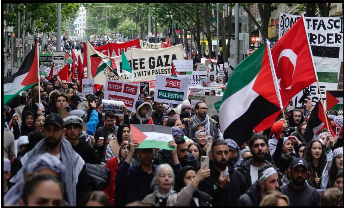
Thousands converge at the State Library, Victoria, Australia.