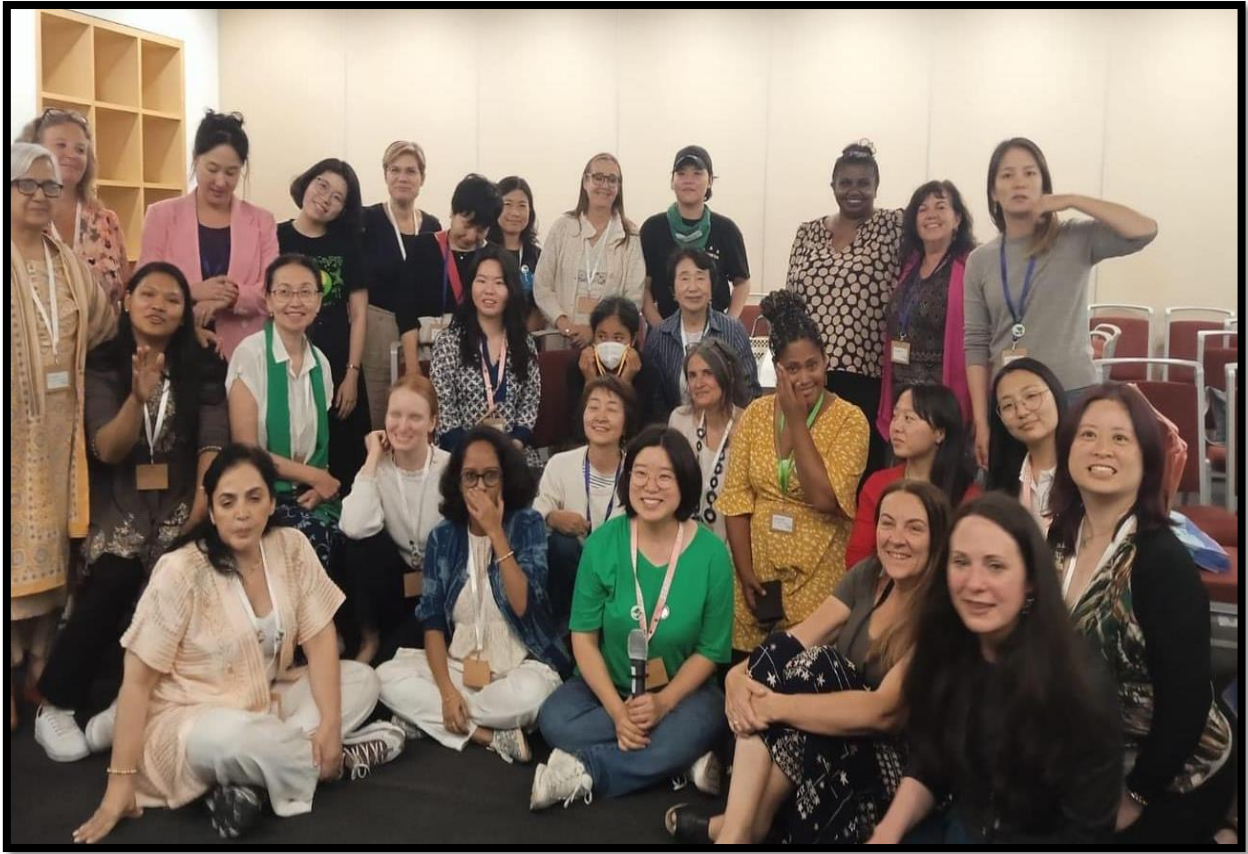
Tankiu to the Key Women who supported the APGWN over the years.