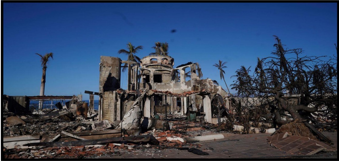
Lahaina and wildfire catastrophe (Aug23) *This item is included because Lahaina-Hawai'i is part of the Pacific region.