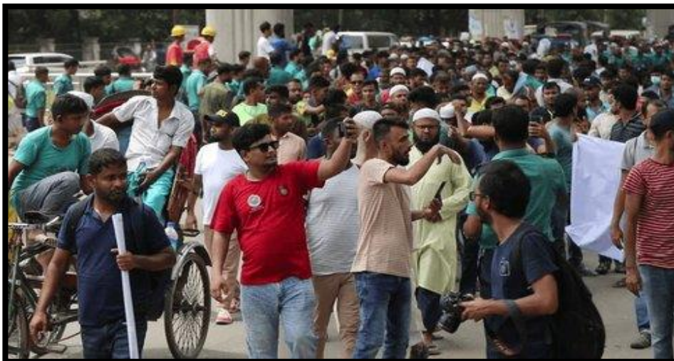
Disabled community protests.