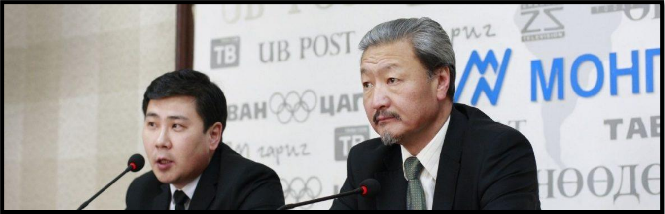
GPM's core members who maintain hopeful optimism.

MGP have bravely fought to influence the economic and political crisis with increasing poverty, stating that it is intolerable. They closely follow the political play and are not afraid to urgently call for dissolving current governments and instituting transitional governments. They have also issued challenges concerning the public health policy of the government, indicating it should be more effective for the people. They keep fighting for current issues, for example, child mortality in Ulaanbaatar caused by air pollution is higher than anywhere else in the world.