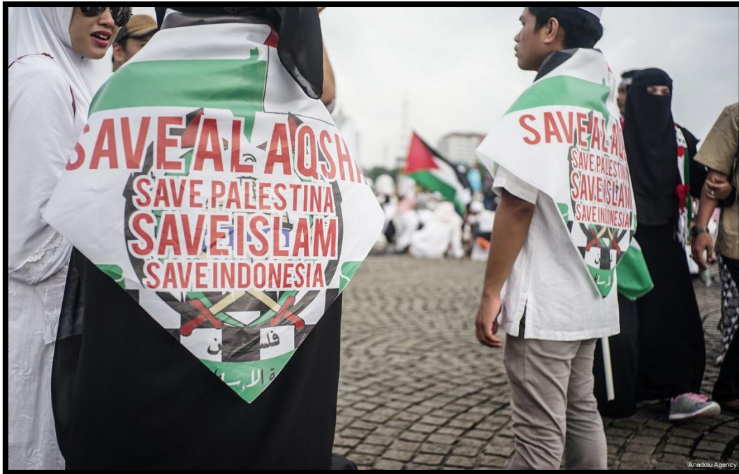
Thousands-Millions of Indonesians protesting for #SupportPalestine.

■More pertinent, it will concern the rights of Indonesian citizens to freely assemble and express their support of the Palestinians, it will mean they cannot hold protest marches as they have been doing since Oct23 to #SupportPalestine.