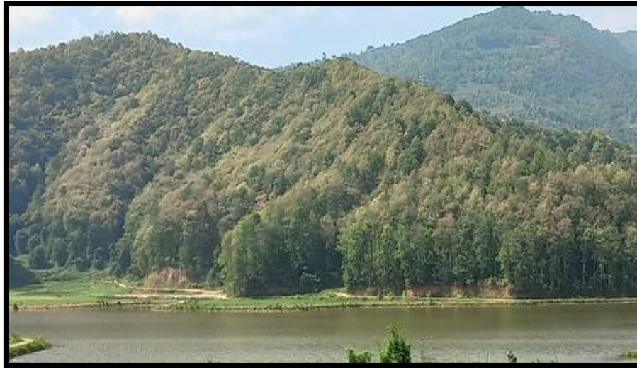
Himalayan glaciers have been melting 65 percent faster since 2010 than the decade before.