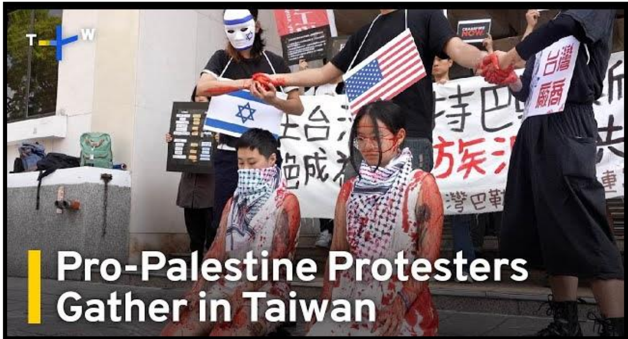
Visual demonstration of Taiwan protestors for #supportPalestine NB: not a pic of GPT, a general picture of support.