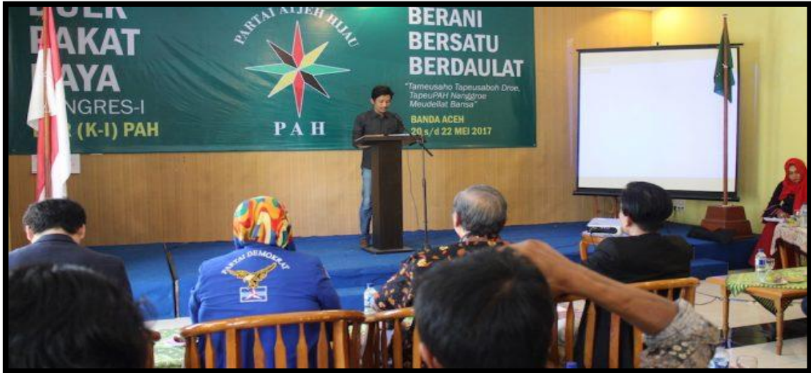
The Atjeh Green have been actively canvassing for increased support across their seven target districts.