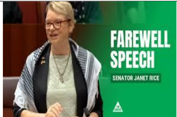
Ms Janet Rice Former Senator Australian Greens