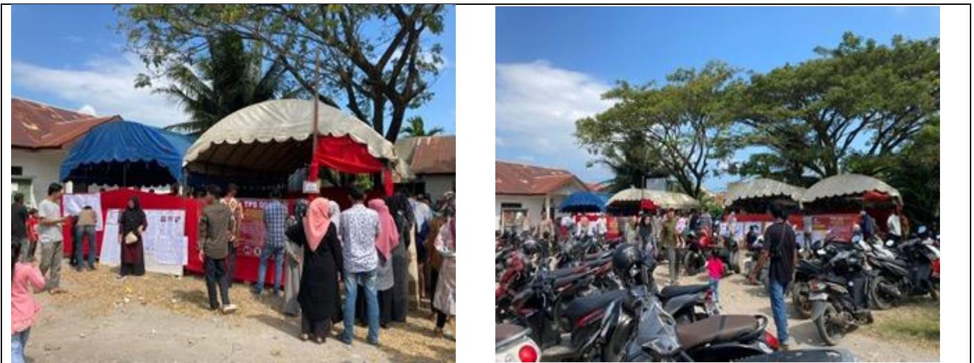
Voting Process from PAH perspective (2023)

■ Atjeh Greens note that the authorities continued to prosecute people for crimes against the security of the state for exercising their right to freedom of expression, including those calling for independence of Papua. At least three Papuan activists were imprisoned during the year for expressing their opinions; and so Atjeh Greens are keeping an eye on the New Criminal Code that is coming into play, because it will not only restrict the rights of the Papua but also their rights as Indonesians who may express and lobby for issues of social justice. It is about the rights of all Indonesians.