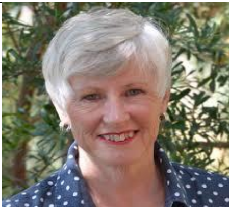
Ms Christine Milne Global Greens Ambassador

To all still serving/outgoing APGF Leaders, Thank You Mahalo Nui for your exemplary Green Service!