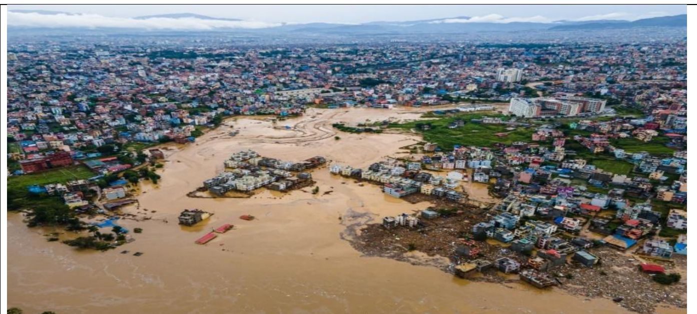
Flooding of the Nakhu River at Lalitpur-Nepal, affecting riverbanks and homes during heavy rainfall in Lalitpur, Nepal (Sept24).