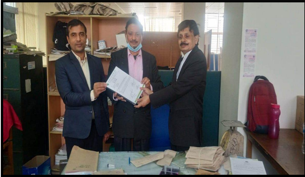
Leaders of GPB and historic registration.

■ On Sunday 22/01/201, at 10,45 am, "Bangladesh National Green Party" submitted the second letter of the Election Commission as the first selection party for registration by the Bangladesh Election Commission! This is an important victory because the Party has worked against all odds and challenges to successfully achieve this milestone.