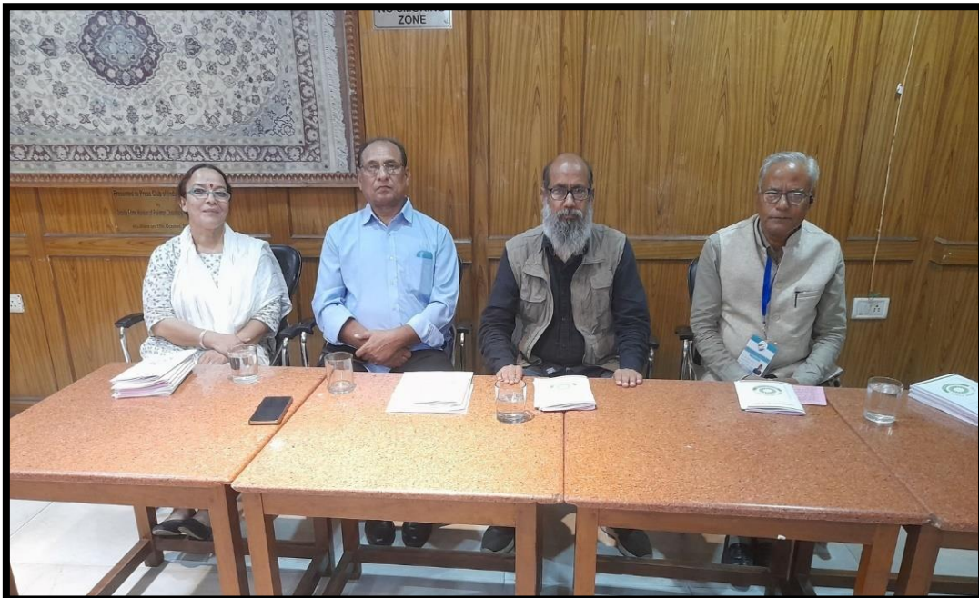
iGP manifesto, Charter of Hope, for the parliamentary election-2024, was released on 18 May 2024 at the Press Club of India premises, launched on 14 May 2024.

As part of their Memorandum, they ' Recognise that without equality between men and women, no real democracy can be achieved' as they ' Commit ourselves to social justice and equal opportunity, non-violence, decentralisation, community-based economics, feminism, respect'.